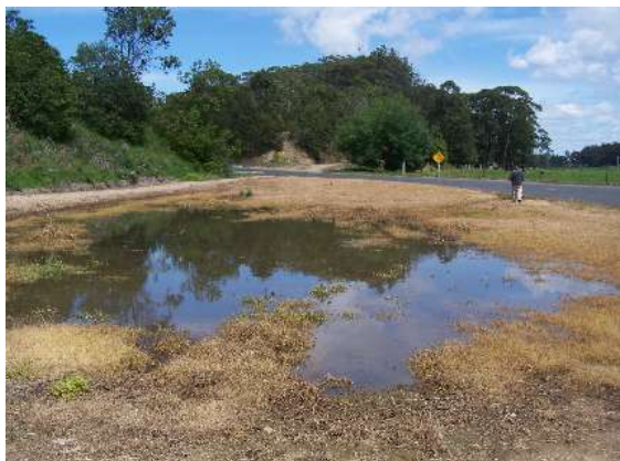
Before the planting - a 30cm deep lake!