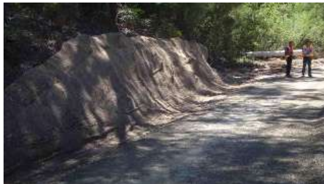
View of the diversion of the Rail Trail east of Nowa Nowa, ready for sealing.

Trail users are asked to still take care when moving through this section and especially if machinery is in use. Please obey directions from work crews.