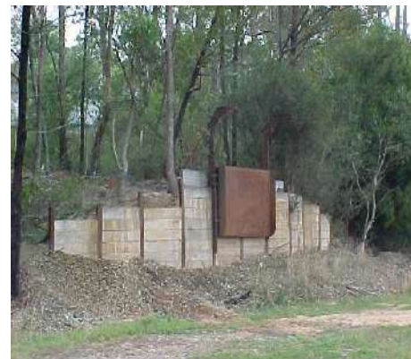
Nowa Nowa loading facility