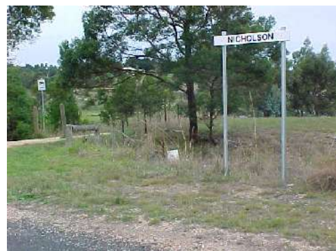
Site of the old Nicholson Station