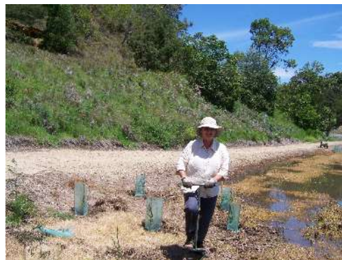
The hot weather took its toll and the "lake" disappeared.