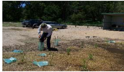
Friends working hard at planting 200 native shrubs.