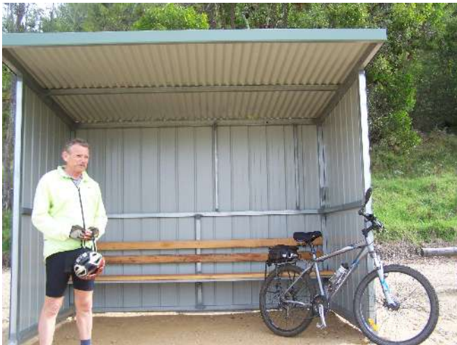
New shelter - a notice board has since been added to the back wall.

More information signage and seating is planned for the site.