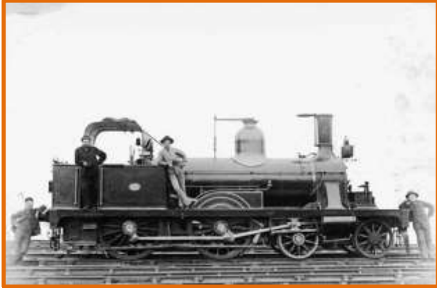
C CLASS STEAM LOCOMOTIVE on the East Gippsland Line

The term rolling stock refers to any vehicles that move on a railway. It usually includes both powered and unpowered vehicles, for example locomotives, railroad cars, coaches, and wagons.